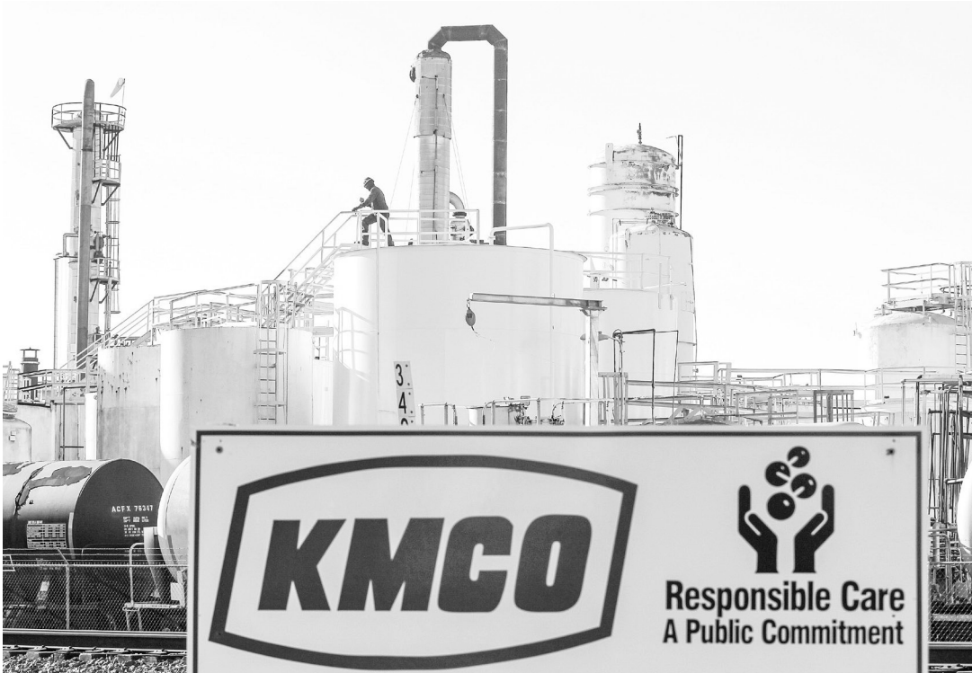
The KMCO plant in Crosby stores organic peroxides, which can burn and explode. Pipes from the plant are visible to neighboring residents.

The Chronicle received AkzoNobel Surface Chemistry's Tier Two in 2016. A&M evaluated its inventory using the study methodology, and the plant landed on the high potential for harm list.