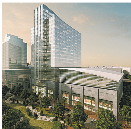
An architect's rendering shows what the new Exelon headquarters at Harbor Point could look like.

By the time the Baltimore Chrome Works closed, the soil beneath it was laced with chromium and the groundwater so tainted that officials estimated that 62 pounds of chromium compounds were oozing into the Patapsco every day. Allied spent $110 million through the 1990s removing the old plant and encapsulating the chromium-tainted soil and groundwater there.