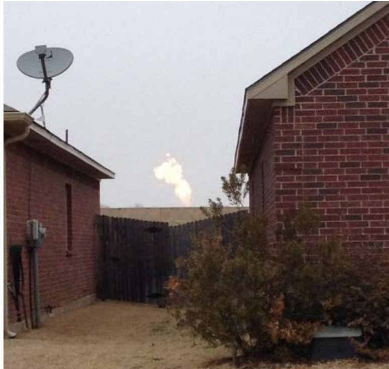
Gas wells were drilled and fracked in two locations beside this neighborhood in Denton in North Texas, including the one being flared behind these homes. City voters went on to ban fracking in Denton last month.

In a study published last year, prostate cells exposed to supposedly safe levels of arsenic and estrogen for six months turned cancerous. Co-author Kamaleshwar Singh , an assistant