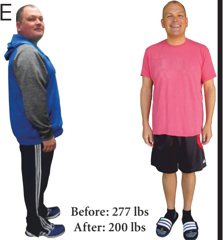
Before: 277 lbs After: 200 lbs

"For the first time in years I feel physically and mentally fit."